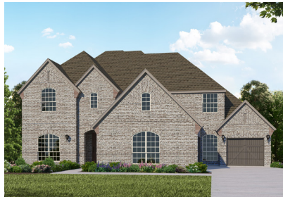
7209 FIRESIDE DRIVE $1,161,556 | Available December Plan B836A | 4,431 s.f. | 2-Story 4 Beds | 4 Full Baths | 2 Powder Baths | Study Media Room | 3-Car Split Garage