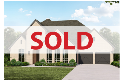
11225 HICKORY FALLS Plan B834A | 4,322 s.f. | 2-Story 5 Beds | 5.5 Baths | Study | 2 Dining Areas Media Room Downstairs | 3-Car Garage