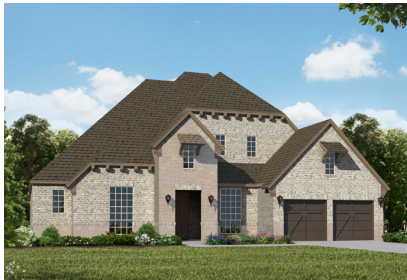
11224 HICKORY FALLS $1,055,302 | Available November Plan B838B | 3,523 s.f. | MLS#20365643 1-Story | 4 Beds | 4.5 Baths | Study Media Room | 3-Car Garage