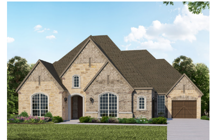
7304 CANYON POINT $1,271,288 | Available December Plan B807B | 4,571 s.f. | 2-Story 5 Beds | 5.5 Baths | Study | Game Room Media Room Downstairs | 4-Car Split Garage