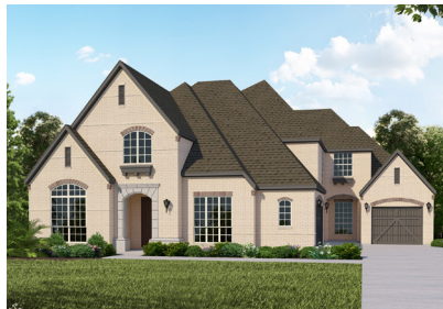
7405 CANYON POINT $1,171,733 | Available December Plan B810A | 5,033 s.f. | 2-Story 5 Beds | 5.5 Baths | Study | 2 Dining Areas Media Room | 4-Car Split Garage