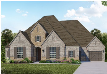
7305 CANYON POINT $1,015,900 | Available December Plan B914D | 3,520 s.f. | 1-Story 4 Beds | 3.5 Baths | Study | 2 Dining Areas Media Room | 3-Car Split Garage