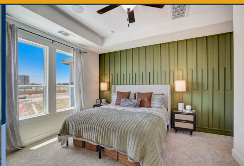
18909 Schultz #1004 $365,240

Aspen Floor Plan 3 bed | 2.5 bath | 2 story