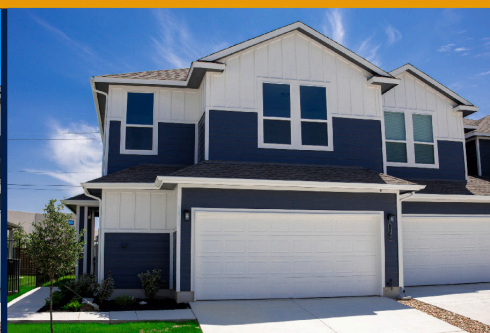
18909 Schultz #1104 $360,900

Lavaca Floor Plan 3 bed | 2.5 bath | 2 story