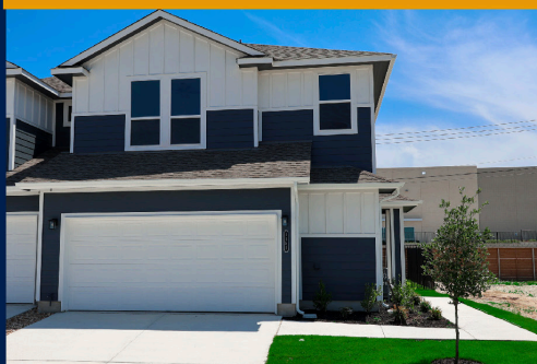
18909 Schultz #1101 SOLD!

Sanford Floor Plan 3 bed | 2.5 bath | 2 story