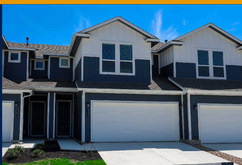
18909 Schultz #1102 $350,900

Sanford Floor Plan 3 bed | 2.5 bath | 2 story